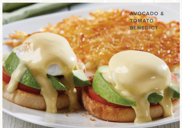
AVOCADO & TOMATO BENEDICT

The breakfast classic lightens up! We start with two farm-fresh poached eggs*, griddle an English muffin to perfection, add sliced avocado and tomato, then pour on creamy hollandaise sauce. Served with a side of crispy golden hash browns. (870 cal) $12.49