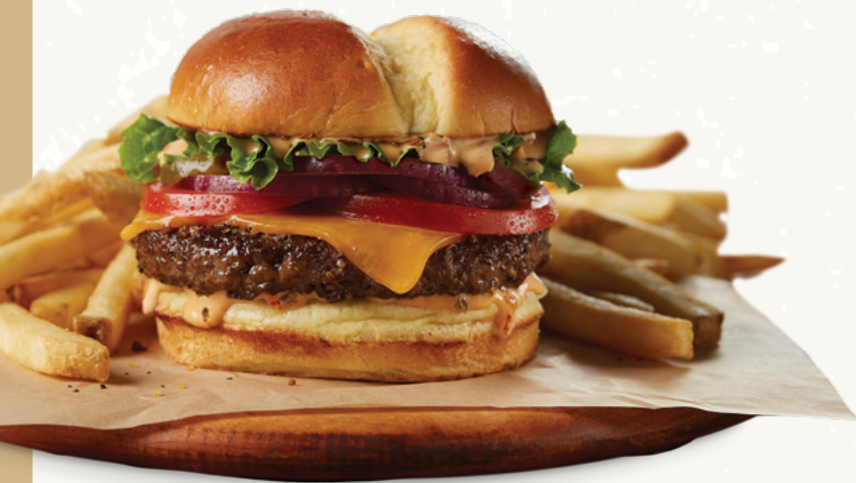
SHARI'S SIGNATURE TILLAMOOK® CHEDDAR BURGER