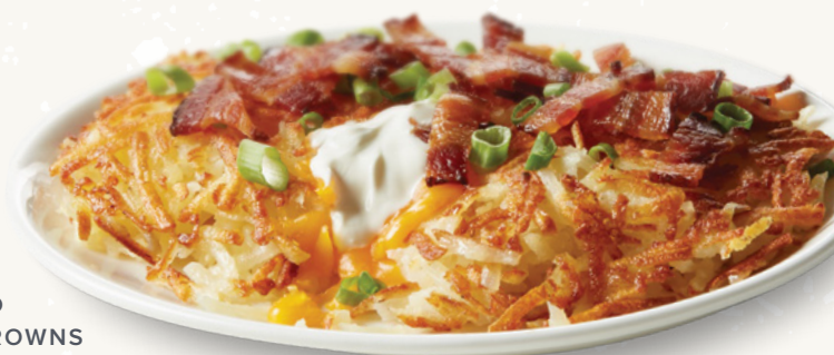
STUFFED HASH BROWNS