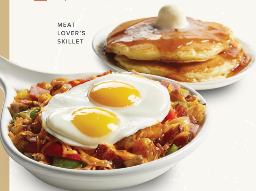
MEAT LOVER'S SKILLET

We start with a generous portion of crispy hash browns, add Applewood-smoked bacon, country ham, sausage, peppers, onions and cheddar cheese and top it all with two farm-fresh eggs*. (1330-1770 cal) $12.99