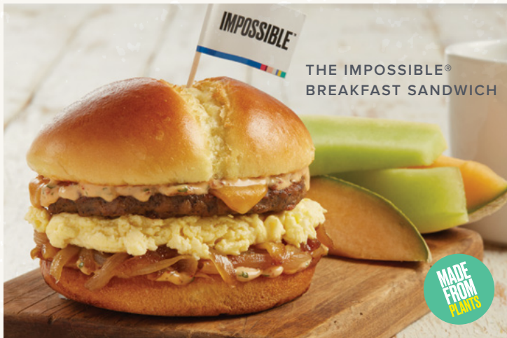
THE IMPOSSIBLE ® BREAKFAST SANDWICH