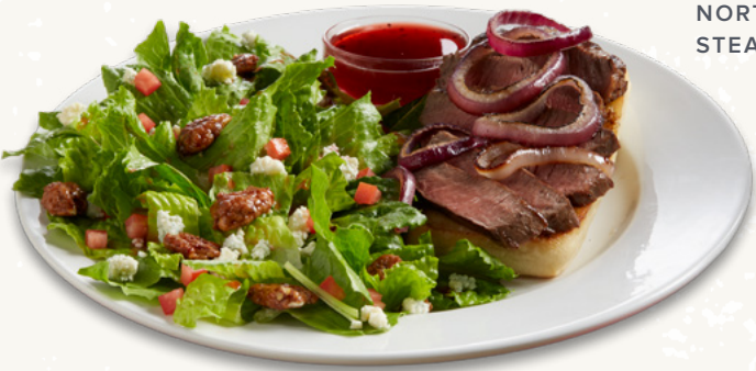
NORTHWEST STEAK SALAD

Flame-grilled choice top sirloin* on toasted bread, with bleu cheese, toasted pecans, caramelized onions, romaine lettuce and our raspberry vinaigrette. (890 cal) $12.99