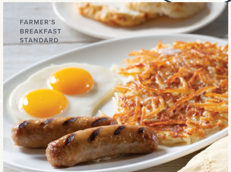
FARMER'S BREAKFAST STANDARD

Mouthwatering top sirloin* cooked as you like it with two farm-fresh eggs* done your way. (790 cal) $15.49