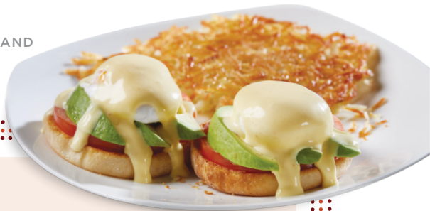
AVOCADO AND TOMATO BENEDICT