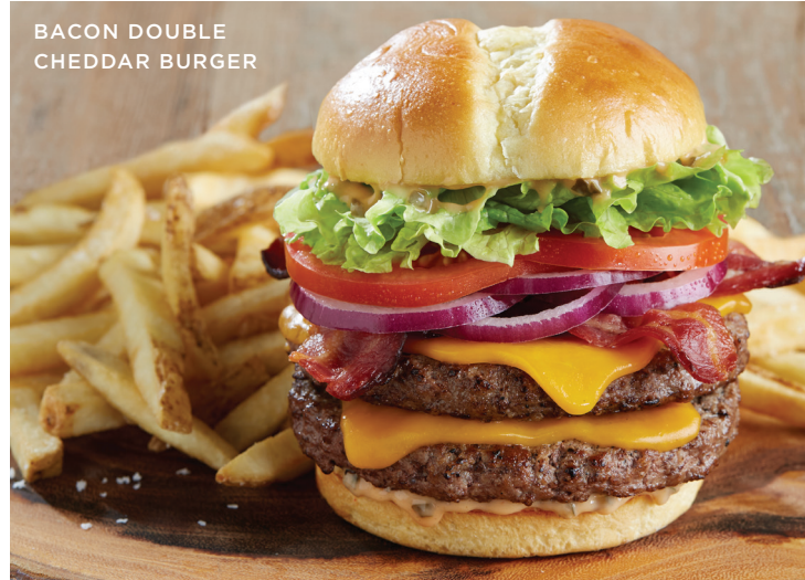
BACON DOUBLE CHEDDAR BURGER

Made with a fresh beef patty*, Applewood-smoked bacon, Tillamook® cheddar, caramelized onions and BBQ sauce griddled to golden perfection on sourdough bread. (1070 cal)